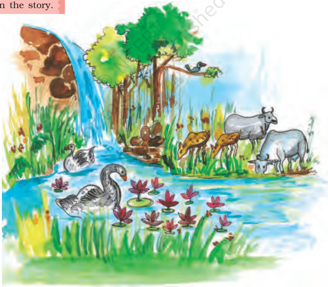
Fig. 1.3: A Pond Ecosystem

Heera from Jaisalmer exclaimed, "We get no rains. We see only 'kikar' and sand, as far as the eyes can see." "But you also find camels", said Ravi.